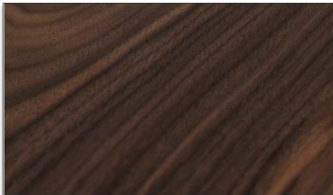
Clear Coat on Walnut

*Walnut is available with a Clear Coat Finish only.