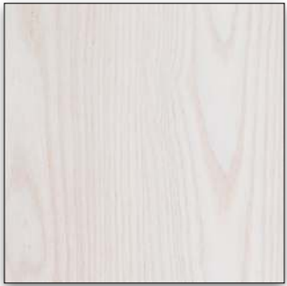
Alabaster - AL9