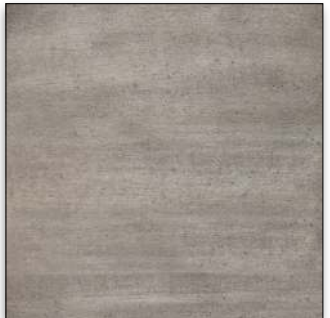
Alpine - ALPI0