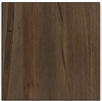
Cashew - CA14