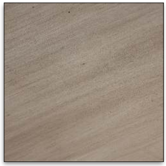
Mica - MI6