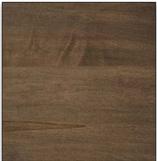
Brentwood - BR13