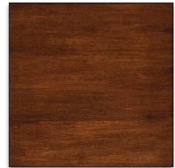
Saddle - SA8