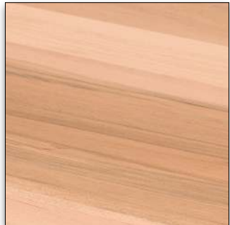
Clear Coat - CC11