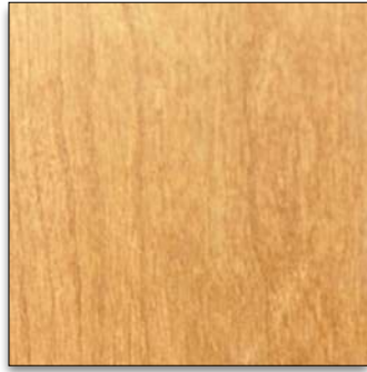
Monticello Cherry - CH2