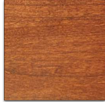
Washington Cherry - CH4