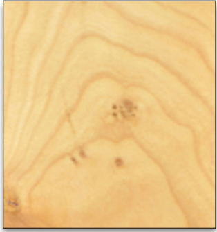
Natural Cherry - CH1