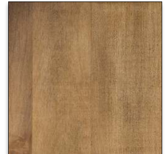
Wheat - WH12