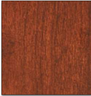
Williamsburg Cherry - CH5