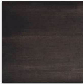
Raven - RA7