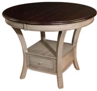
Customized Color To Fit Customer's Decor