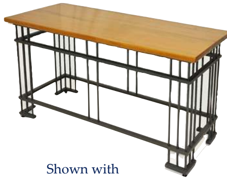
Shown with Monticello Cherry Top