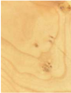
CH1 Natural Cherry

*Additional Colors To Coordinate With Your Design Palette Are Available Upon Request