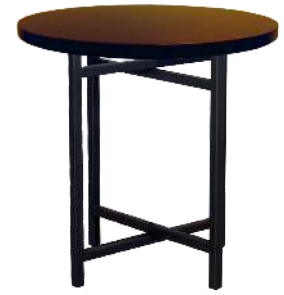
Shown with Williamsburg Cherry Top